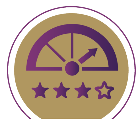
The Underlying Debt Securities are Rated for Credit Quality