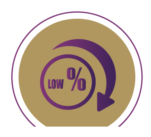
Debt Funds have the Lowest Risk